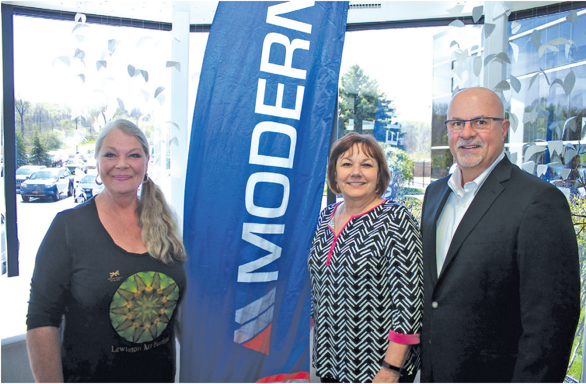
Modern Corporation will sponsor one of Lewiston's biggest events of 2021: This weekend's Art Festival on Center Street.

"The Lewiston Art Festival is almost here, and we gratefully acknowledge the community support of our friends and supporters at Modern Corporation for their generous sponsorship of the Lewiston Art Festival!" Lewiston Council on the Arts stated. "We are proud to partner with Modern to lessen the environmental impact created by the influx of thousands of visitors to Lewiston."